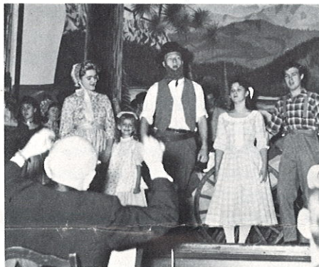
The "Hand Cart" Song

piano whose ability and talent always does so much for the Chorale presentations.