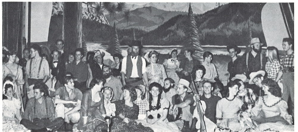
Candid photograph taken at conclusion of "Westward Ho!" concert.